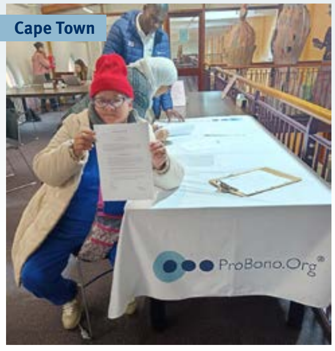
Cape Town Wills Week