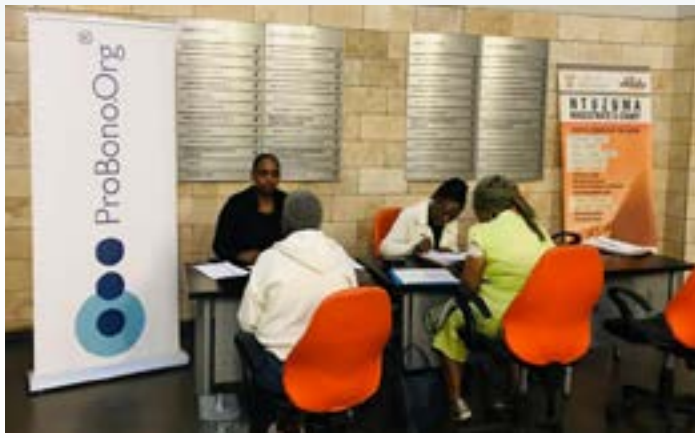
Wills Week Durban