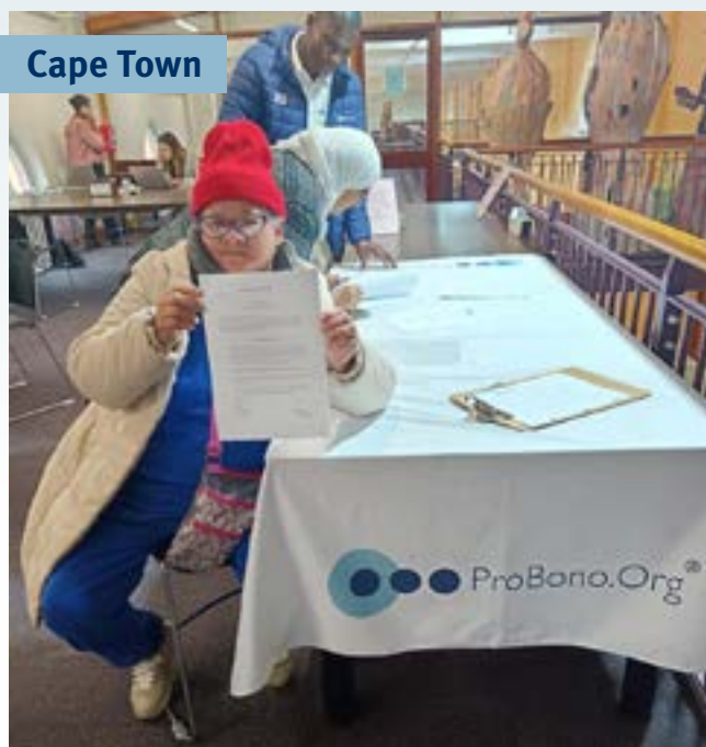
Cape Town Wills Week