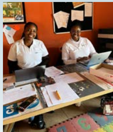
Wills Month Dobsonville