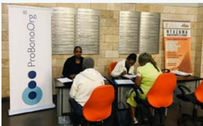
Wills Week Durban